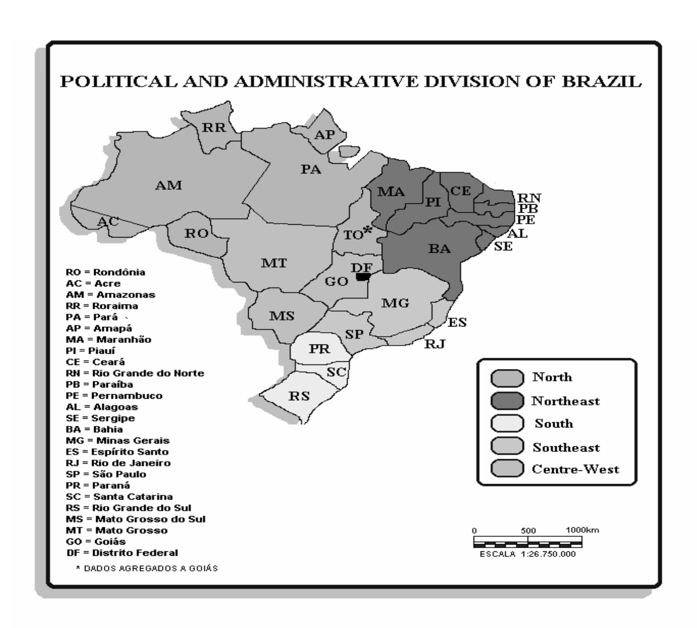
Illustration 1: Brazil - Macro-regions and States

at reproductive age<sup>9</sup> that represents the female population at risk for each health region selected.